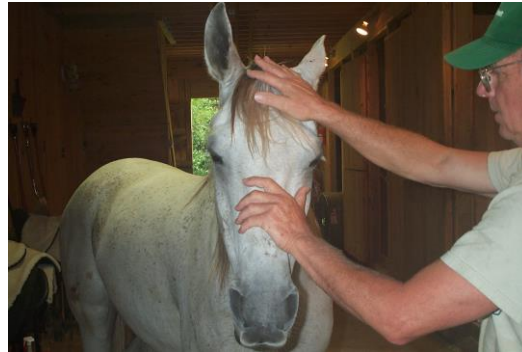
Placing my hand on his nose, saying "WAIT" and giving a light squeeze means "stop rubbing".