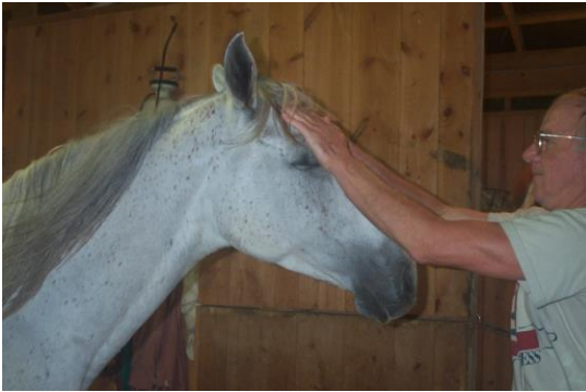
Magic is rubbing on my hands, not my body

Horses will also rub on just about anything, including you. This can be very annoying and dangerous. It creates a problem in Vet checks if the Vet is trying to examine him while he is rubbing on you...and even more of a problem if he rubs on the Vet! If a horse whacks you under the chin with his head, it can result in serious injury. There are two ways to deal with this. When I trained Sunny I never allowed him to rub on me with his head in any form or fashion. With Magic, I allow him to rub his head on my HANDS only and taught him that a "WAIT" with either of my hands on his nose means to stop rubbing and keep his head still. The easiest way and probably the best for most people is to NEVER allow rubbing.