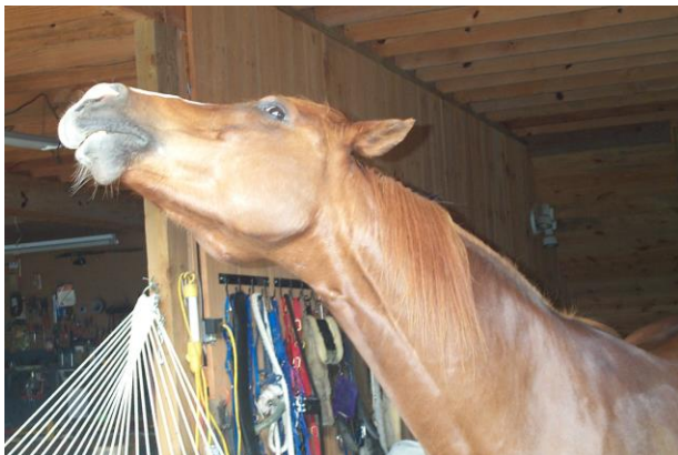
Sunny is enjoying the scratching of an “itchy spot” under his tummy.

You may find that there are areas of your horse's body that he doesn't like you to handle. If this is the case, spend more time grooming him there. However, don't create a confrontation over it unless he becomes aggressive. For example, if he doesn't like you to play with his ears touch his ears briefly and move on before he reacts. Groom elsewhere, and then come back to the ears again. Be patient and give him time to deal with it, but be persistent. The same can be said of other “stuff”. If he doesn't like raincoats, then “Mr. Raincoat” should visit every night at dinner! If he doesn't like spray bottles, he gets sprayed every day...even if it's only with water. Avoiding an “issue” with your horse only leads to other “issues”.