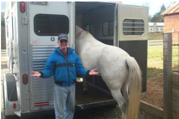
Magic stops as he loads with two feet on with a verbal "WAIT".