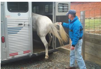
Magic unloads with a tug on his tail and stops with his front feet still in the trailer on "WAIT".